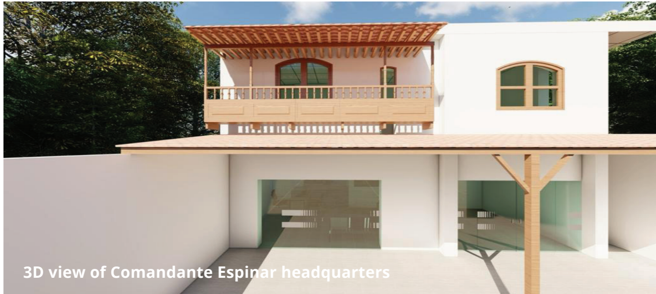
3D view of Comandante Espinar headquarters