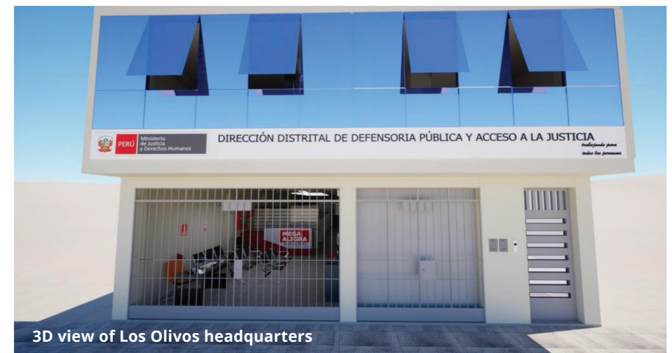
3D view of Los Olivos headquarters

By 2024, the Eje No Penal Program is scheduled to carry out the physical refurbishment of the ALEGRA and Mega ALEGRA centers of Kaquiabamba and Andarapa in Andahuaylas, Pasco, Majes and Camaná in Arequipa, Maynas in Iquitos, Tacna and Huánuco, with which it reaffirms its commitment to continue supporting the ALEGRA centers of the Public Defense for the benefit of the population that is not in a position to pay for a private lawyer. guaranteeing their right to justice.