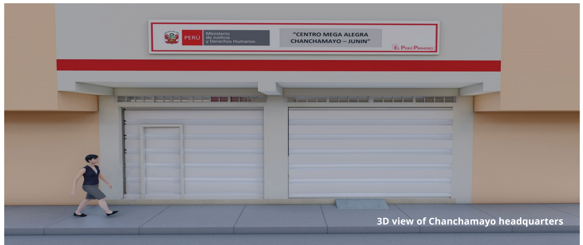
3D view of Chanchamayo headquarters