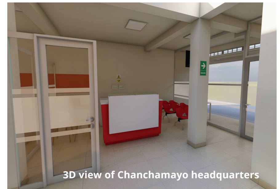
3D view of Chanchamayo headquarters