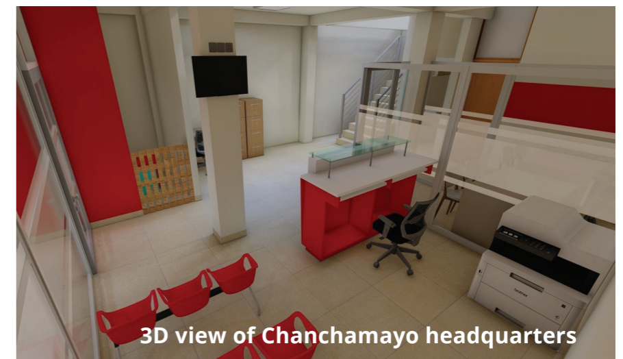
3D view of Chanchamayo headquarters