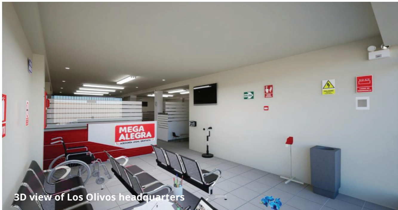
3D view of Los Olivos headquarters