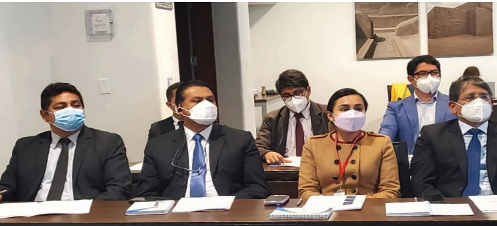
The interviewee must become a good reference or source of reference for a journalist.