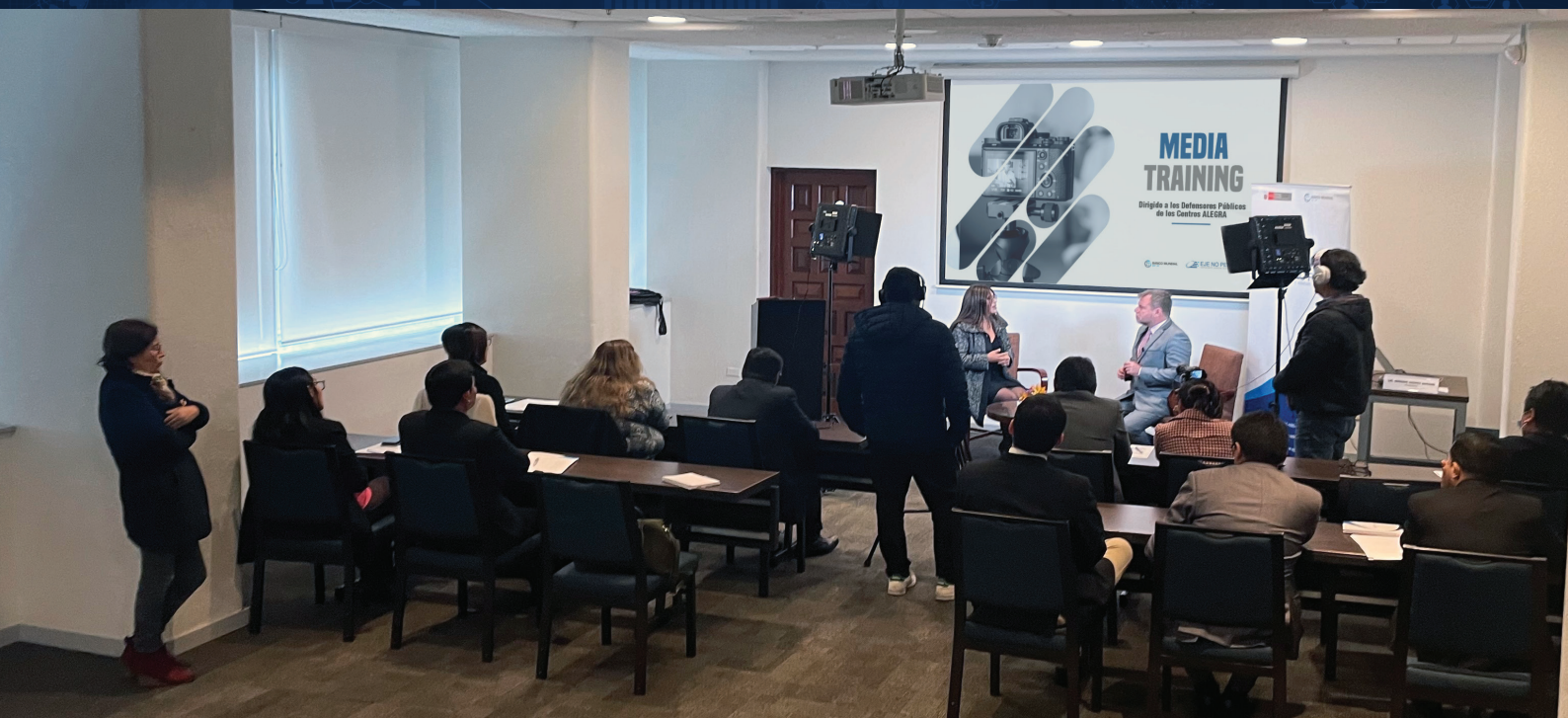
The media training used different communication techniques either to face a reputational crisis or to position a message.