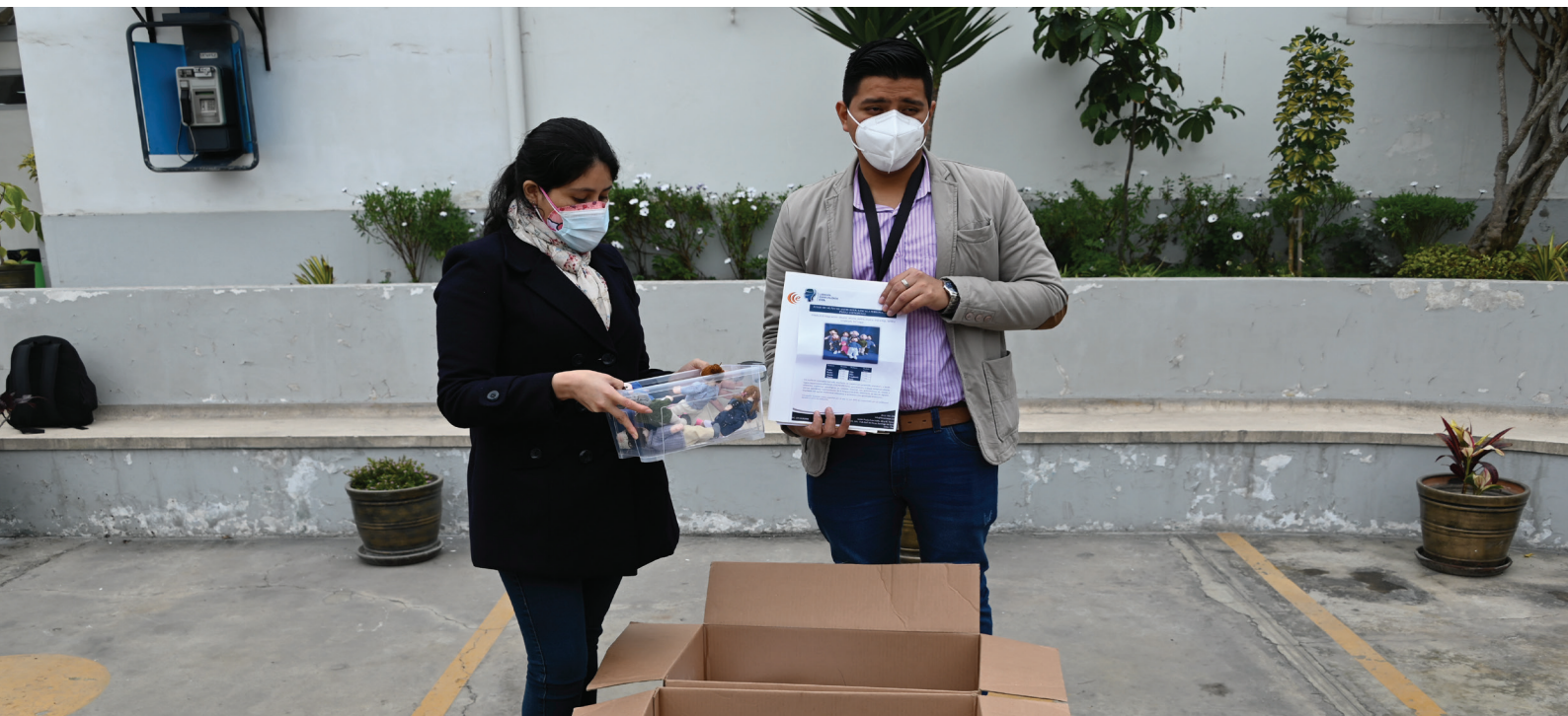
Major purchase for Alegra free legal advice centers with the financial support of the World Bank.