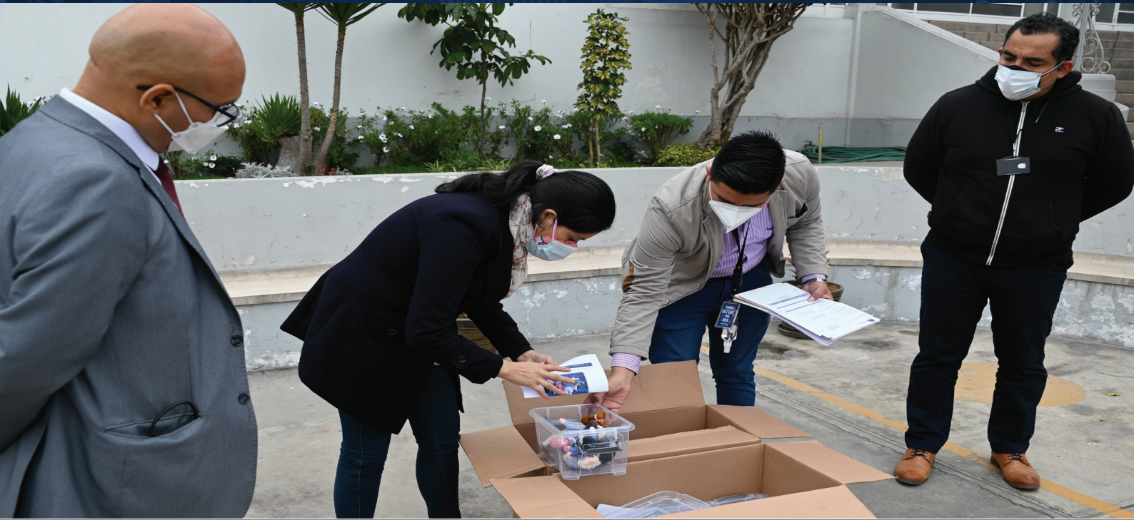
13 kits of asexual dolls to determine emotional, behavioral, sexual abuse disorders in children.