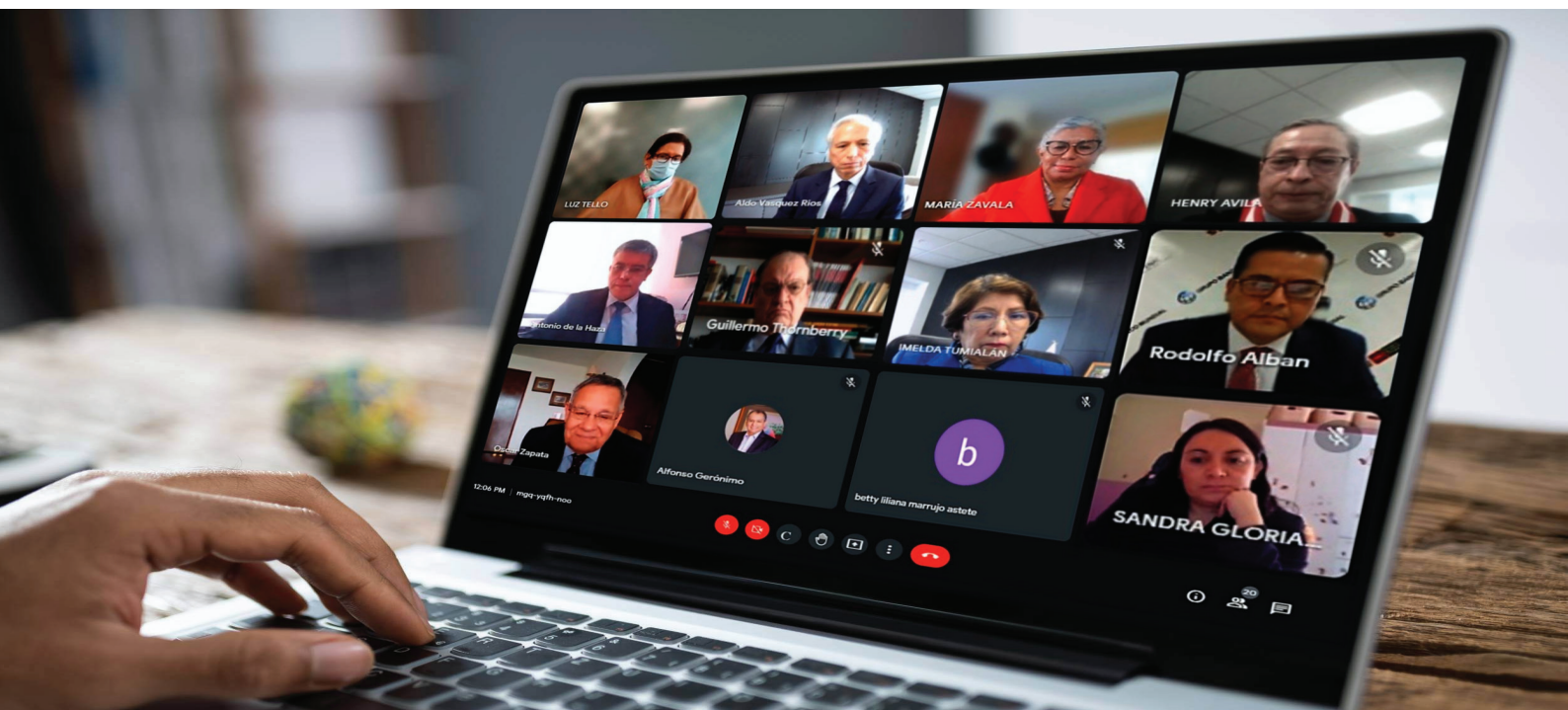
In a meeting with the full Board, the PMSAJ technical team reported the status of the project and the benefits of the PCM document management platform.

In this regard, he indicated that this component is oriented to the development of systems, technology and infrastructure, and is in the fourth stage of its execution. He also considers the proposed terms of reference, which are under review Component two comprises three sub-components: i. Better capacity of the technological infrastructure; which contemplates the improvement of the data center, that is, the strengthening of the central processing infrastructure of the JNJ, as well as the improvement